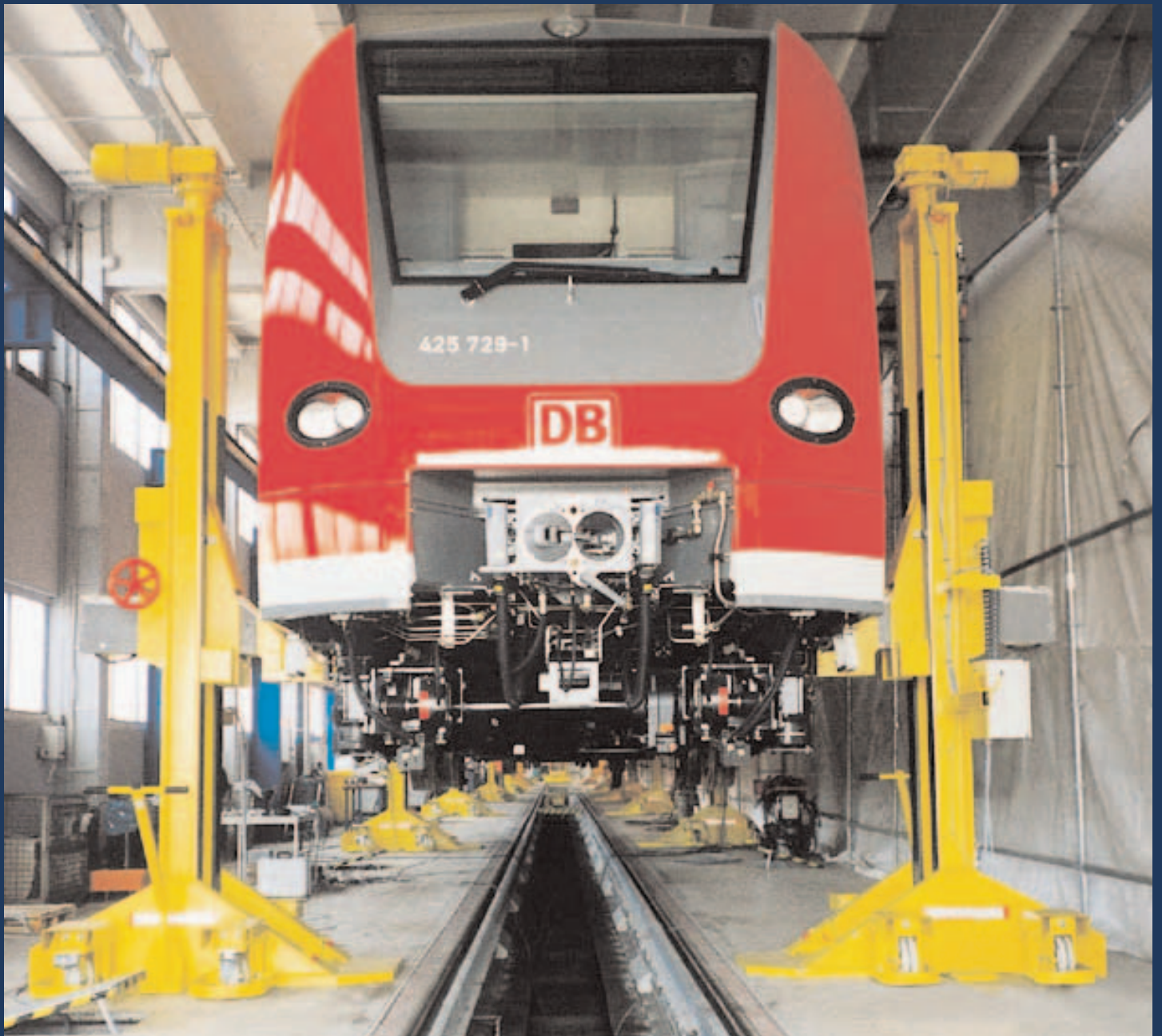
Mobile Lifting Jacks Type FL/VN